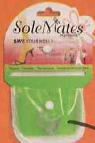
heel protectors Sole Mates High Heeler, $10, thesolemates.com

Don't you hate when your shoes get stuck in the grass? Slide these on before you walk on the lawn for pictures. They'll keep you above ground!