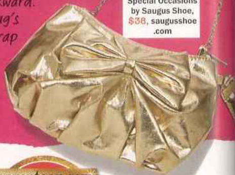
bag Special Occasions by Saugus Shoe, $38, saugusshoe.com

Juggling a clutch all night can get awkward. Sling this bag's extra-long strap over your shoulder and focus on having fun instead.