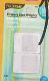
drapery weights Dritz Home, $2, hancockfabrics.com